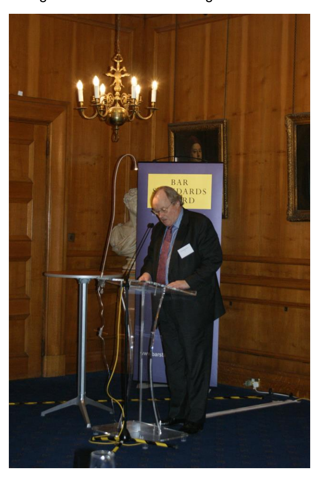
Figure 3 Sir Andrew Burns KCMG

inaccurate perception as a result. Multiple interpretations of language can also present challenges for clients with learning difficulties.